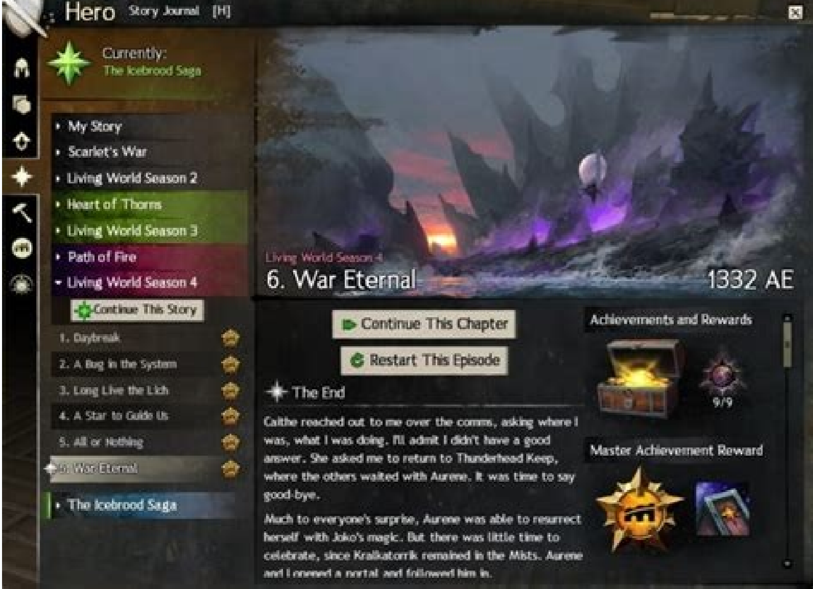
Gw2 how hard is it to get a skyscale. Gw2 fastest way to get skyscale.